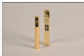
Make-Up Category award winner from YSL

Make-Up Category: Helena Rubinstein, Lipstick - "HR"