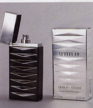
Men's fragrance package is reminiscent of a Zippo cigarette lighter

company has done to develop a new generation of more environmentally friendly alternatives to PE, PET and PP.