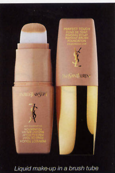
Liquid make-up in a brush tube